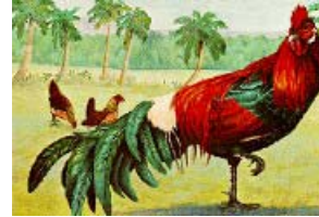
Red Jungle Fowl

Eggs were used as a staple food as far back as 3000 BC. The modern hen is a descendant of the Red Jungle Fowl which was first found in the jungles of South East Asia. Since then hens have spread all around the world. In Australia hens arrived with the first settlers and became an important source of food.